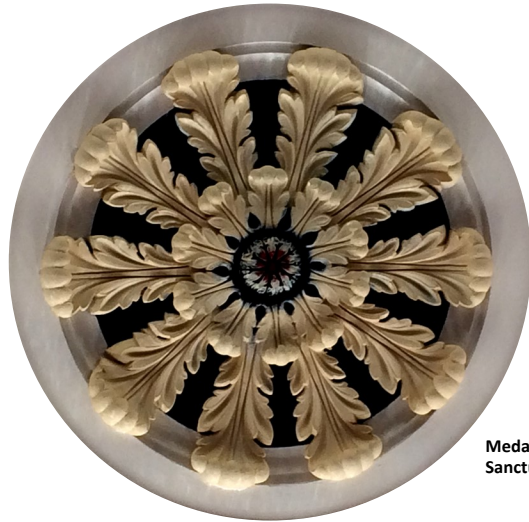
Medallion, Sanctuary Arch

Welcome to First Parish Dorchester, our Unitarian Universalist religious community.