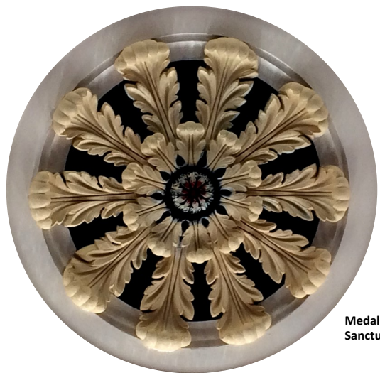
Medallion, Sanctuary Arch

Welcome to First Parish Dorchester, our Unitarian Universalist religious community.