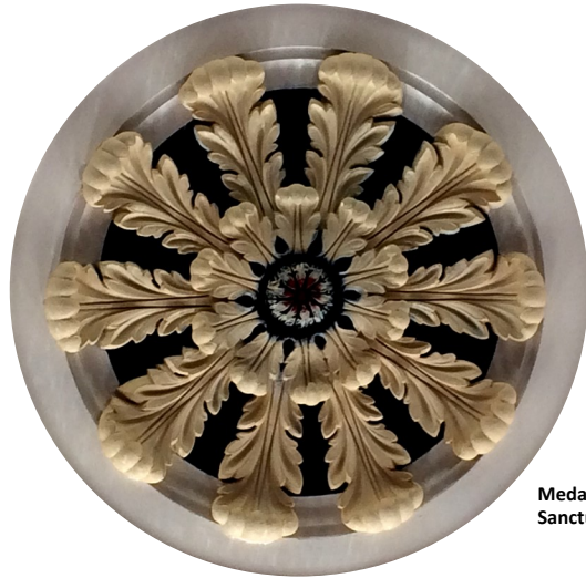
Medallion, Sanctuary Arch

Welcome to First Parish Dorchester, our Unitarian Universalist religious community.